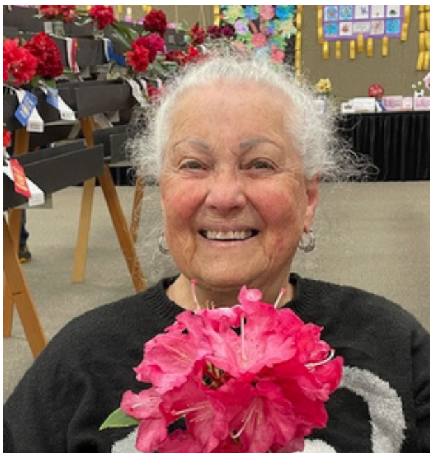
Greentrees residents proudly participate in Florence's annual Rhody Show.

Florence prepares for the 119th Rhododendron Festival