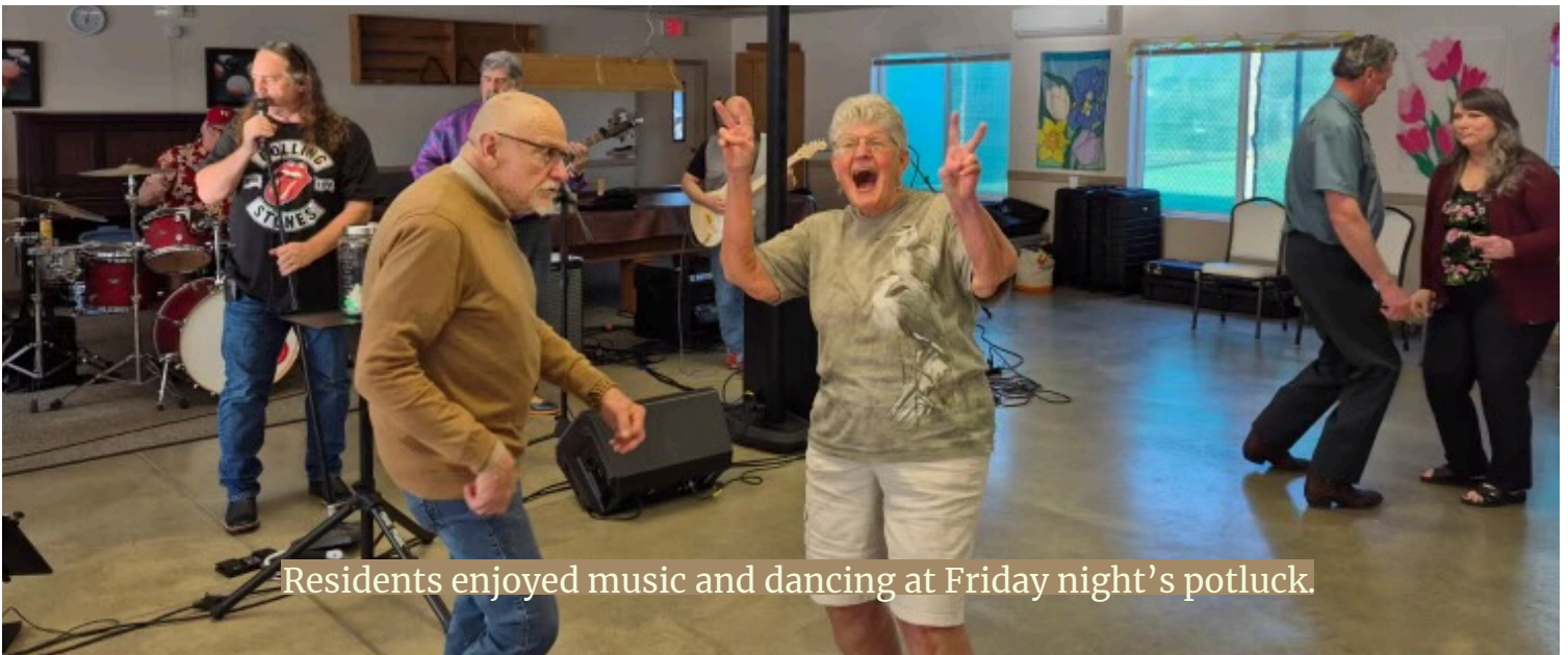
Residents enjoyed music and dancing at Friday night's potluck.