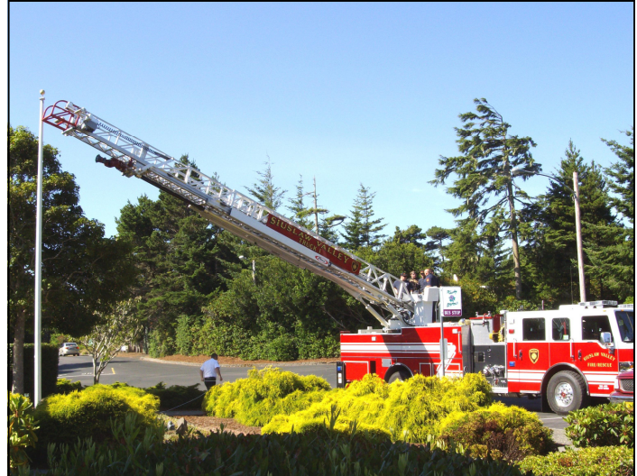
Our friends at the Siuslaw Valley Fire Department were kind enough to bring out their ladder truck to repair the broken flag pole in front of the Greentrees Clubhouse.

The event is open to the general public. Residents may display items for sale around their homes, on drive-