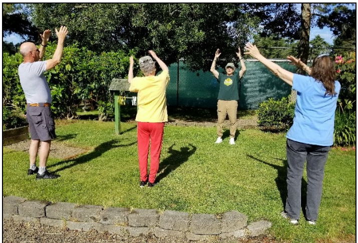
GTV residents enjoy Tai Chi in the dog park. Tai Chi classes are on Monday and Wednesday at 9 AM and on Friday at 11:15 AM.