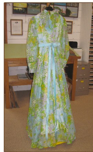
Princess Leslie Erskine's Dress from 1972 Rhody Court