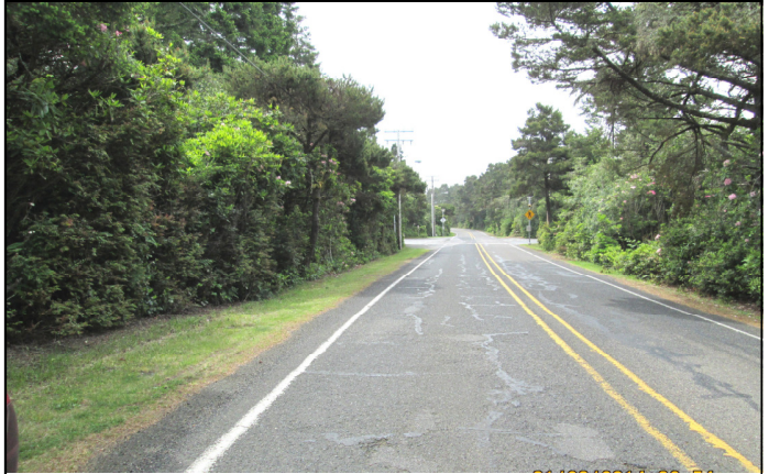
A small portion of the vegetation that the City intends to remove for the proposed 10-foot wide Multi-use path in front of Greentrees Village.

There will be items for sale at the flea market for the benefit of Greentrees. Volunteers will price the items