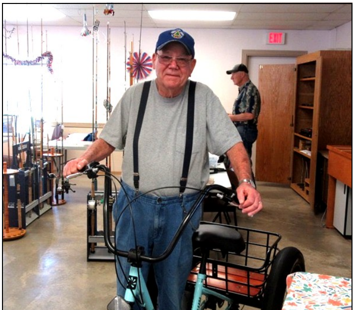
Jim's the Winner!

Did you know you can sign up for email notifications on the Greentrees Village website? Just go to greentreesvillage.com . On the homepage is an area to subscribe to email notifications. Just fill in your name and email address and our web master will send you alerts and emails of upcoming Greentrees Village events.